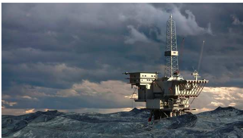
Therban - High performance elastomers for the Oil & Gas Application.